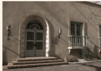
The original Santa Fe Public Library circa 1896

formed in 1892, provides civic, educational, philanthropic